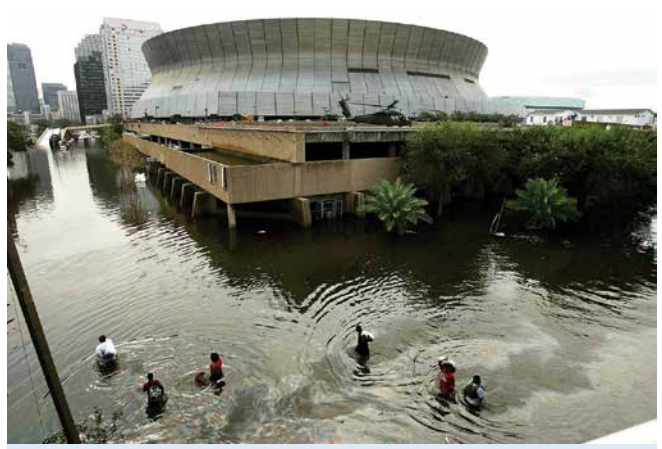
People wade through high water in front of the Superdome in New Orleans, Louisiana, days after Hurricane Katrina.